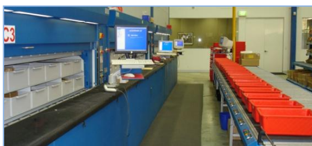
SortBench Multi VC System