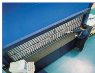
High Density Storage